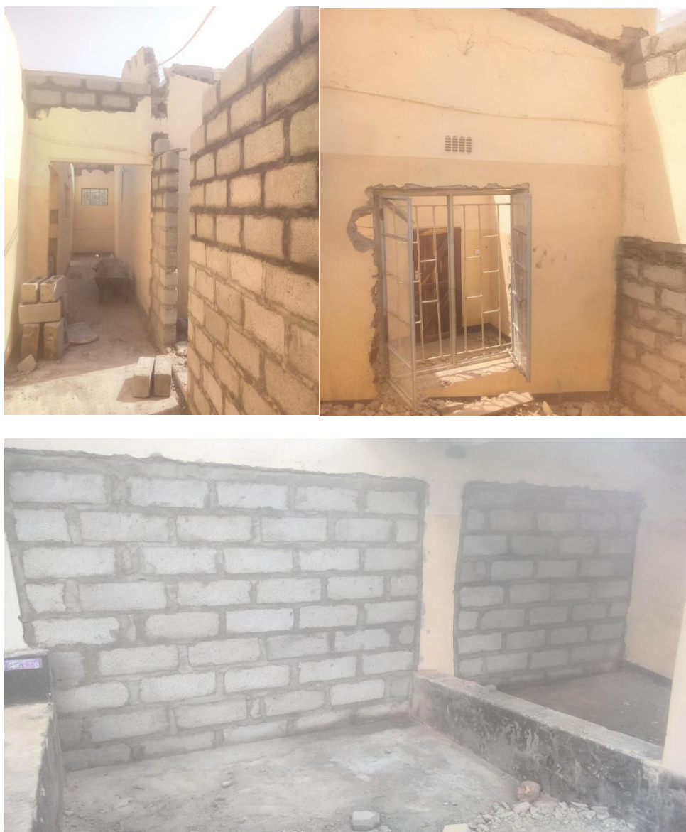
Fig 3: Construction of new store room