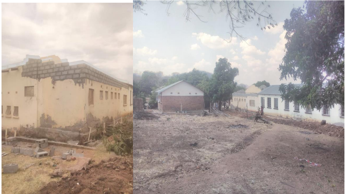
Fig 2: Extension of walls at toilet/shower area