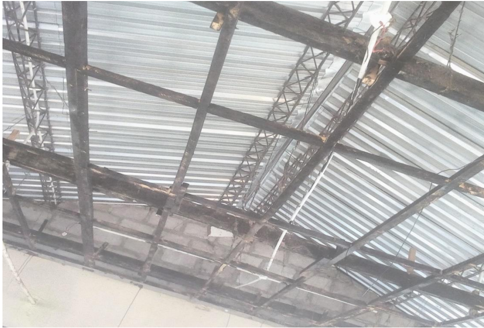
Figure 4: Brandering