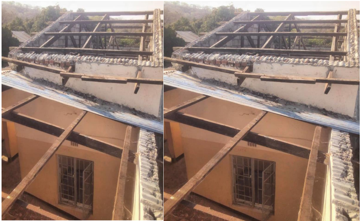
Fig 1: Removing of roofing sheets