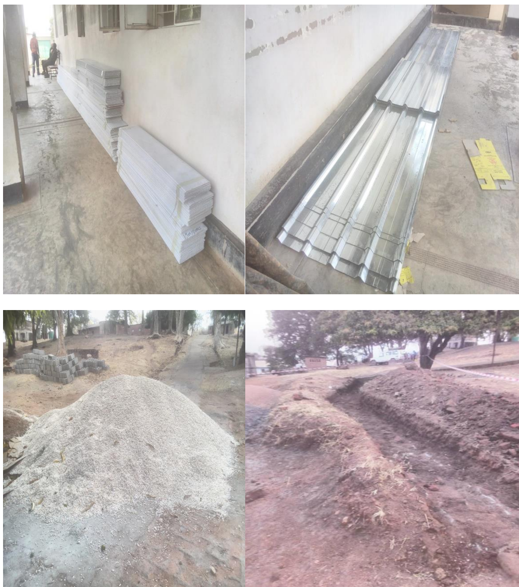
Fig 6: Materials on site and excavation for drainage system